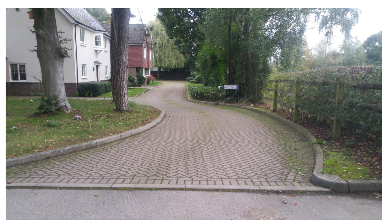
Western access through Oak Farm Place