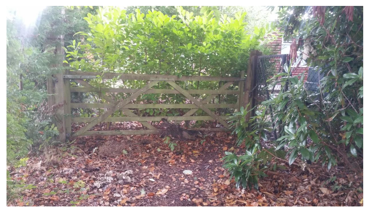
Field gate on eastern access route